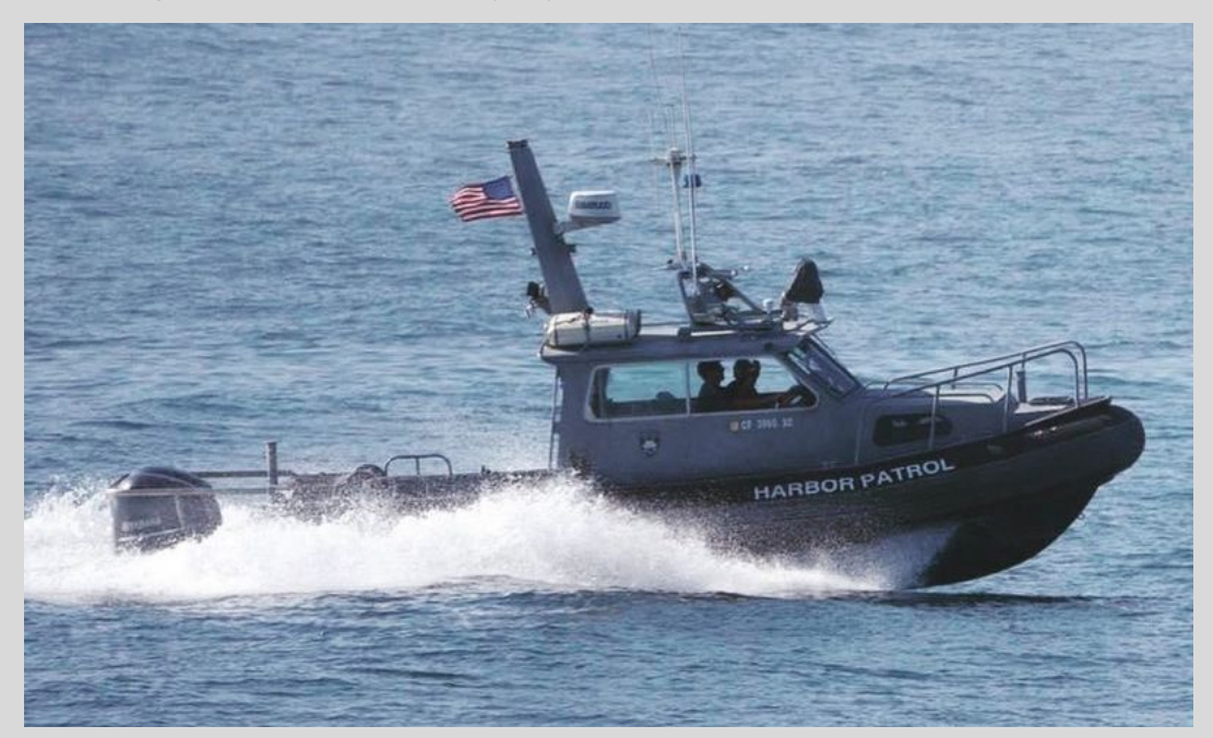
The Port District's Almar patrol vessel.

The procurement of the new patrol vessel would not be possible without the generous grant funding provided by the State of California Natural Resources Agency. This grant funding will ensure that Harbor Patrol can continue to provide marine search and rescue for the community and boating public in the north Monterey Bay for decades to come.