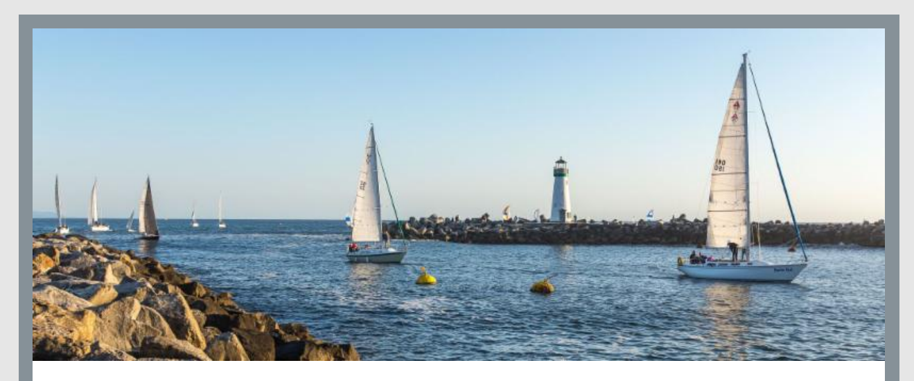
Santa Cruz Port District Newsletter - May 2020