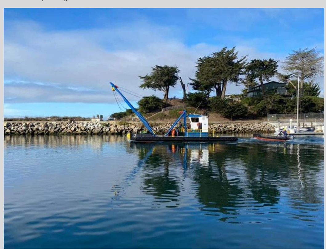
Pictured above the District's workboat Dauntless

unless otherwise marked. Stay at least 50' from the dredge. When dredging is underway, contact the crew for passing instructions on VHF channel 8.