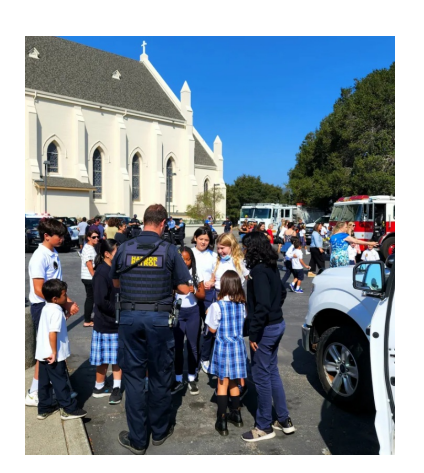
On Friday, September 9, 2022, Holy Cross School held their 20th annual Cookies for